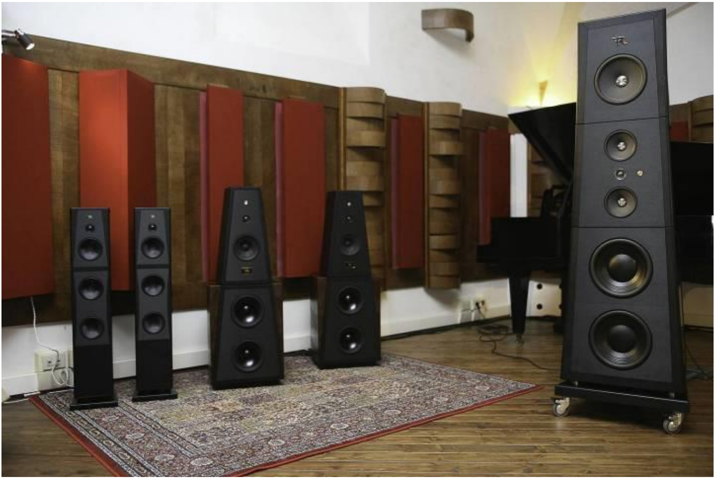
by ROSSO FIORENTINO Florence Italy